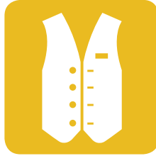
APPAREL & UNIFORMS