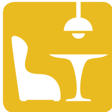
FURNISHINGS AND DÉCOR